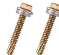
◀ HEX HEAD SELF DRILLING SCREW