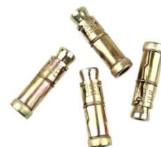
◀ 3PCS SHIELD ANCHOR