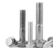
◀ FLANGE BOLT