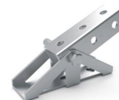
◉ ADJUSTABLE BASE