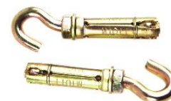
◀ FIX BOLT WITH HOOK