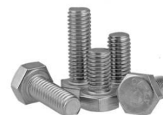
◀ HEXAGON BOLT