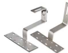
◉ ADJUSTABLE HOOK