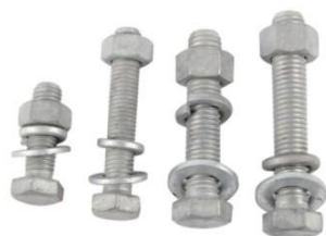
◉ HOT-DIP GALVANIZED COMBINATION BOLUS

Photovoltaic accessories series include hot-dip galvanized bolts, nuts, bases, connectors, stamping parts, aluminum alloy clamps, etc. It is mainly used for the connection and fixation of photovoltaic support.