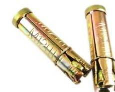
◀ 4PCS SHIELD ANCHOR