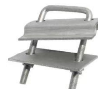
◉ BENDING PRESS PLATE