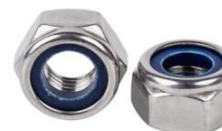
◀ NYLON LOCK NUT