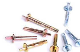
◀ STEEL CEILING ANCHOR