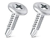
◀ WAFER HEAD SELF DRILLING SCREW