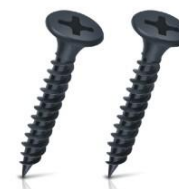
◀ DRYWALL SCREW