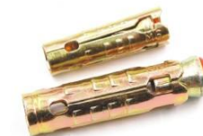
◀ SLEEVE ANCHOR ONE PIRCE WITH RED PLASTIC