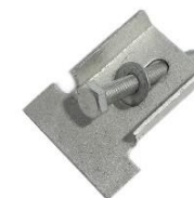
◉ SINGLE HOLE PLATEN