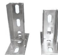
◉ HOLE BASE