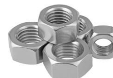
◀ HEXAGON NUT