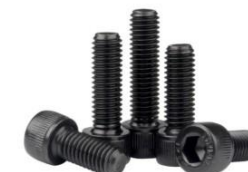
◀ ALLEN BOLT