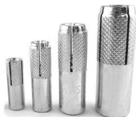
DROP IN ANCHOR ▶