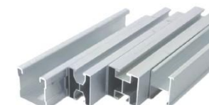
◉ ALUMINUM ALLOY RAIL BRACKET