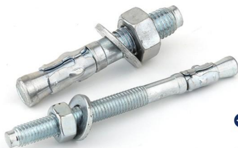
◀ WEDGE ANCHOR

PACKAGING: Neutral carton, Woven bag, Color printing carton color printing carton box