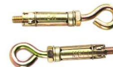
◀ EYE FIX BOLT