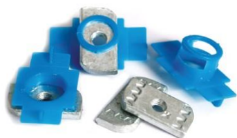
◉ PLASTIC WING NUT