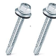
◀ HEX HEAD SELF DRILLING SCREW WITH EPDM WASHER