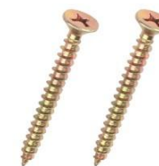
◀ CHIPBOARD SCREW