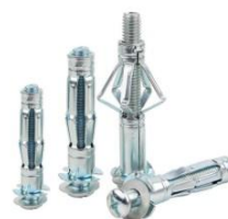
◀ HOLLOW WALL ANCHOR