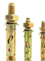
◀ ANTISKID SHARK FIN ANCHOR