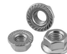
◀ FLANGE NUT