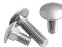
◀ CARRIAGE BOLT