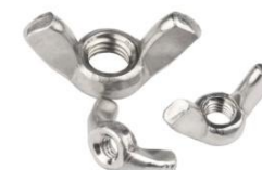
◀ WING NUT