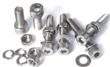
◉ STAINLESS STEEL HEXAGON SOCKET COMBINATION BOLTS