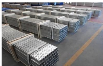
◉ PHOTOVOLTAIC SUPPORT