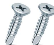
◀ FLAT HEAD SELF DRILLING SCREW